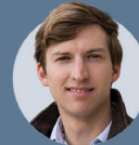
Chris Miller Author of Chip War Associate Professor of International History, Fletcher School, Tufts University