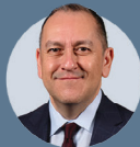
The Hon. Gabe Camarillo Undersecretary of the Army