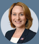
The Hon. Kathleen Hicks Deputy Secretary of Defense

You won't want to miss these key speakers: