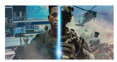
34th Annual NDIA SO/LIC Symposium