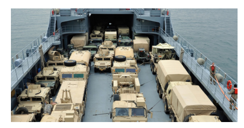
2024 Tactical Wheeled Vehicles Conference