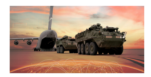
38th Annual National Logistics Forum

February 6 - 7, 2024 | Oklahoma City, OK