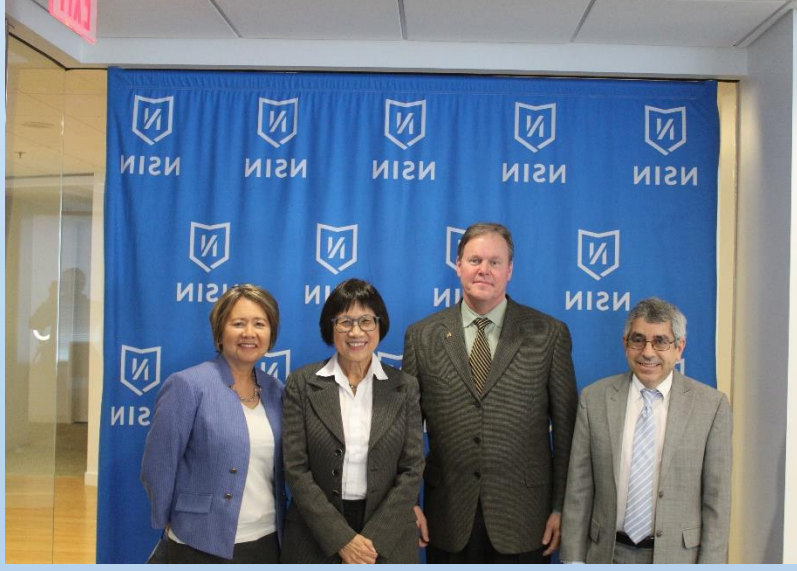
FY24 DOD S&T Budget Priorities Event