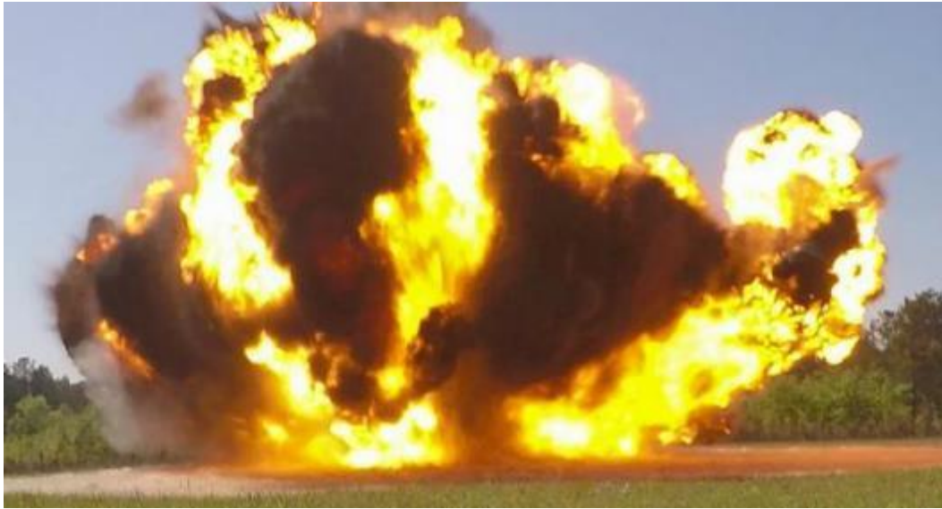
(U) Large Scale Demolition