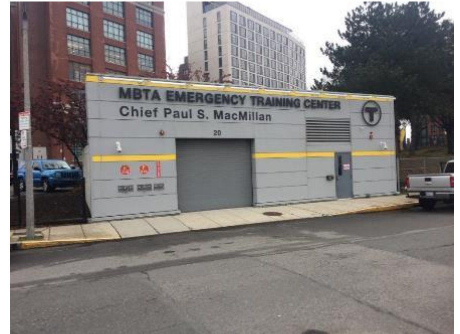
(U) The MBTA's emergency training center located in South Boston