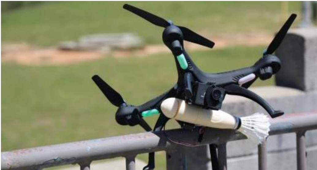
(U) UAS with Improvised Bomblet