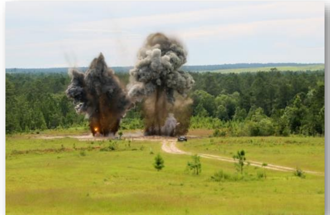
(U) Event Demolitions