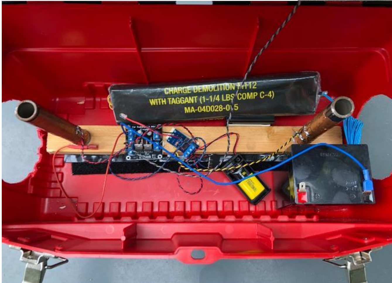
(U) Hand Entry Hostage Device