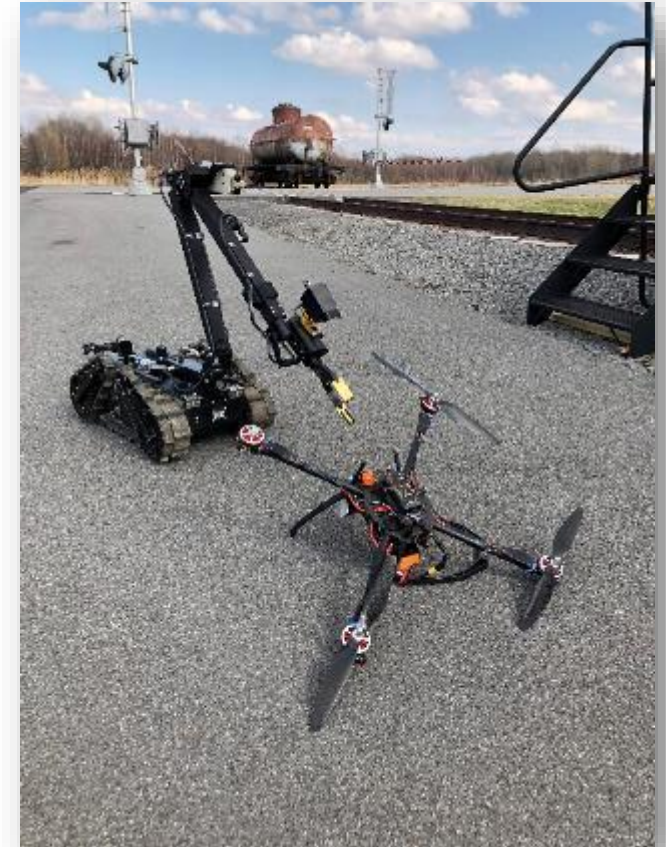
(U) Robotics Used in UAS Mitigation