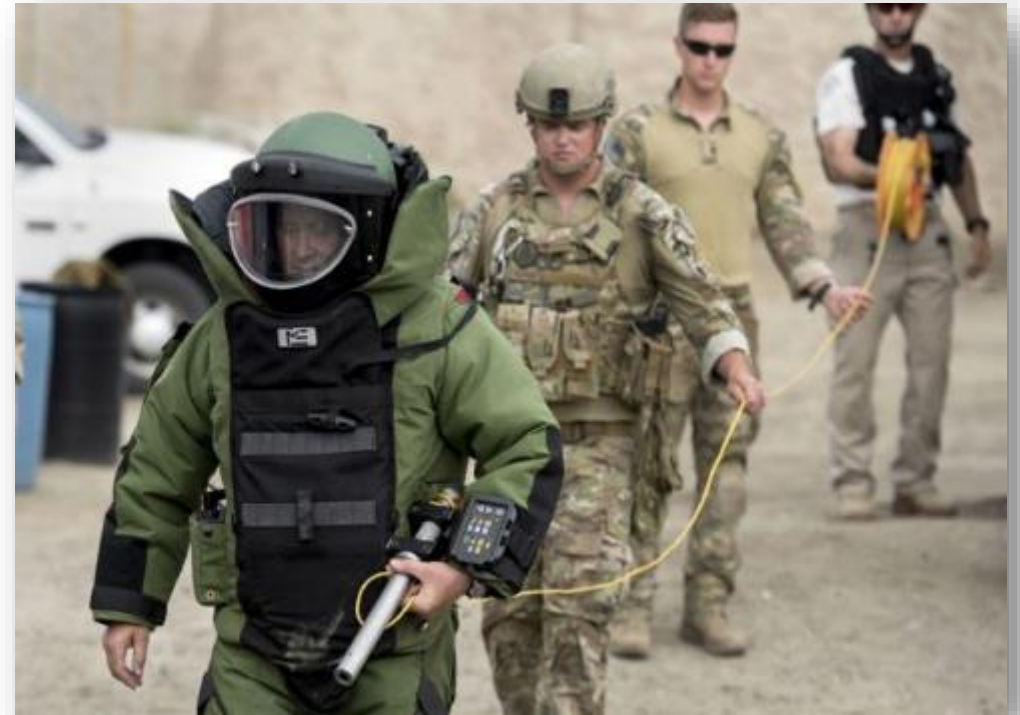
(U) EOD/PSBS Interoperability, IED Approach