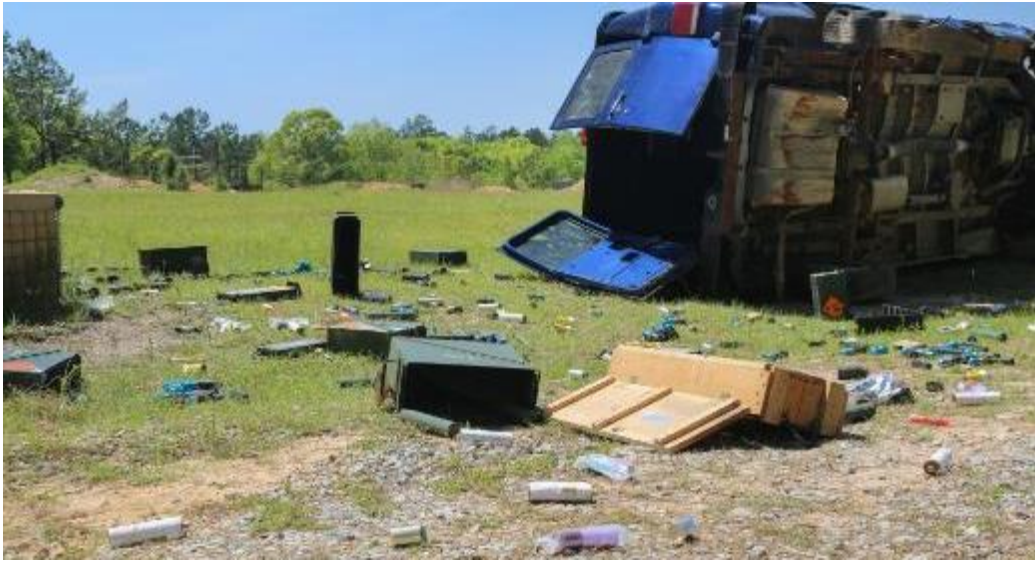
(U) Transportation Accident/Disposal