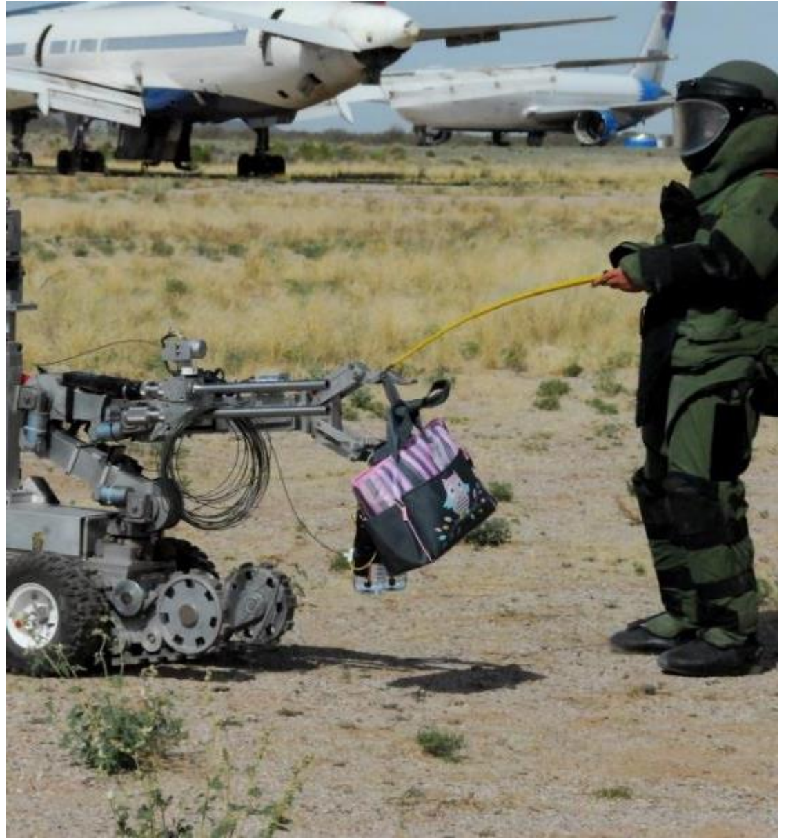
(U) Downloading suspicious device from 747