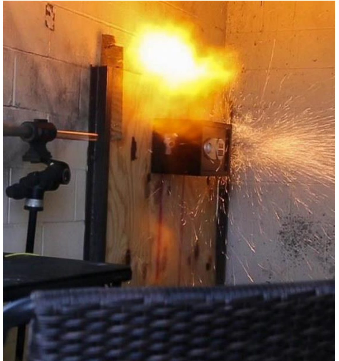
(U) Procedure in progress to preserve safe contents