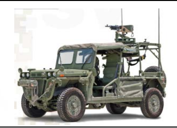
Light Tactical Trailers 5,388 Systems