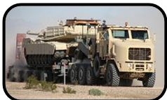
Heavy Equipment Transporter System (HETS)