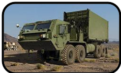
Heavy Expanded Mobility Tactical Truck (HEMTT)