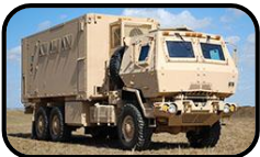
FMTV Based Specialty Vehicles