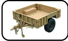
Light Tactical Trailer