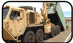
Palletized Load System (PLS)