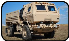
Light Medium Tactical Vehicles (LMTV)