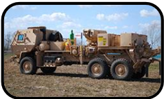
Medium Tactical Vehicles (MTV)