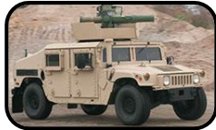
HMMWV With TOW