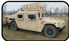
High Mobility Multipurpose Wheeled Vehicle (HMMWV)