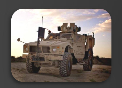
MATV UIK 5,651