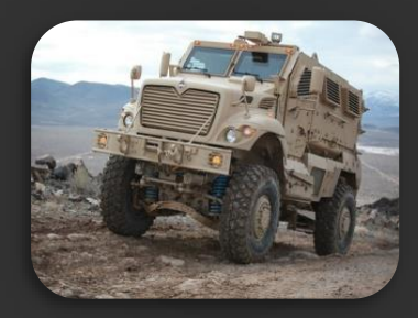
MaxxPro Dash ISS 2,633