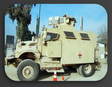
MaxxPro LWB Ambulance 301