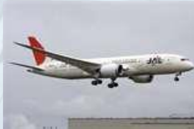
Military and Commercial Aerospace