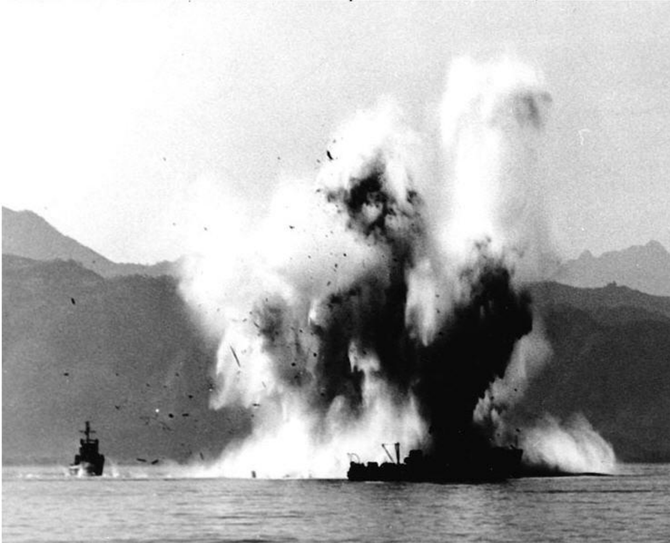
Wonsan Oct 1950