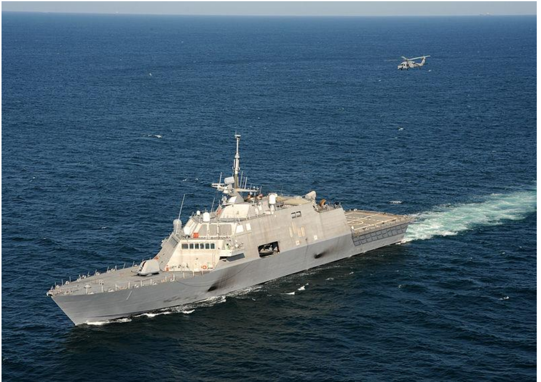
USS FREEDOM LCS 1