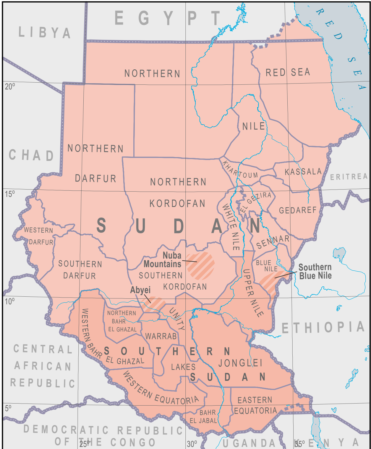
Figure 2.2 Sudan political map

The boundaries and names shown and the designations used on this map do not imply official endorsement or acceptance by the United Nations.