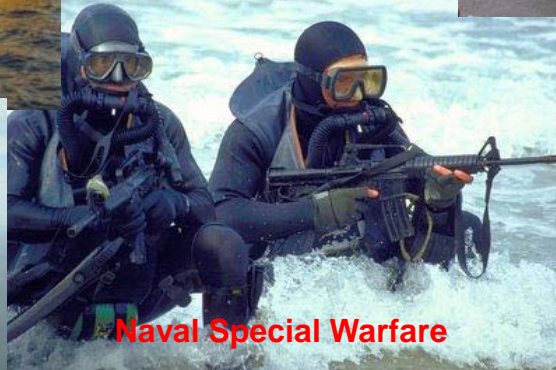
Naval Special Warfare