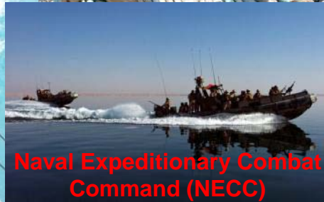
Naval Expeditionary Combat Command (NECC)