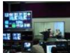
Media Production Center