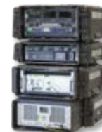
Fly-Away Broadcast System