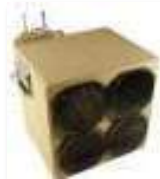
Next Generation Loudspeaker System