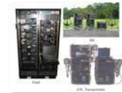
Radio Integration System