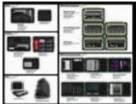
Tactical Local Area Network