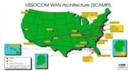
SCAMPI (not an acronym)