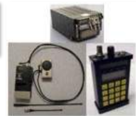
Blue Force Tracking