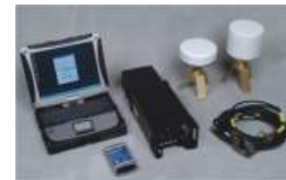
Joint Tactical C4I Transceiver System