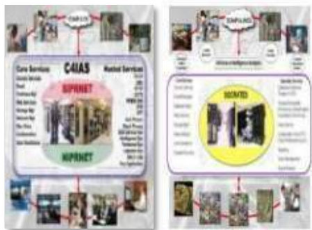
C4I Automation System / Special Operations Command Research, Analysis, and Threat Evaluation System