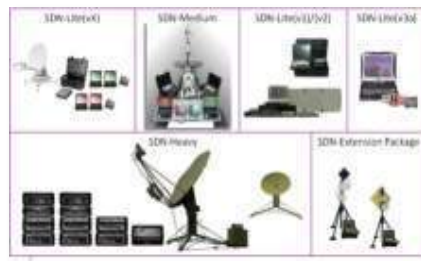
SOF Deployable Nodes / Product Distribution System