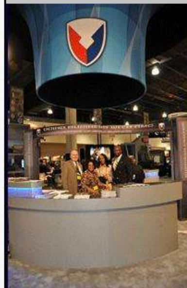
AUSA Winter Symposium in Fort Lauderdale, FL.