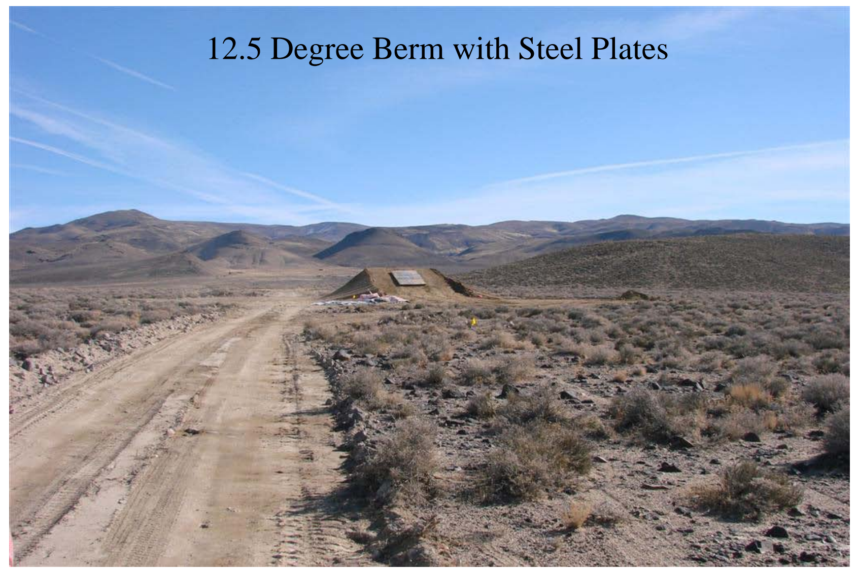
Presentation Approved For Public Release. Distribution is Unlimited