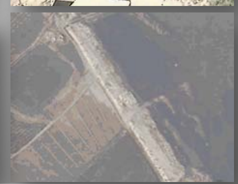
Any Warfighter, Anywhere, All The Time