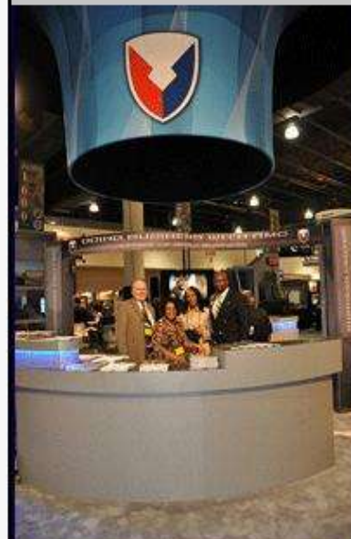
AUSA Winter Symposium in Fort Lauderdale, FL.