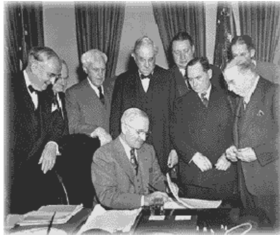
President Truman signs the Foreign Assistance Act of 1948.

“The pessimist sees difficulty in every opportunity. The optimist sees the opportunity in every difficulty.”