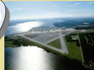
Naval Air Stations