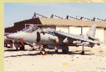
Marine Corps Air Stations