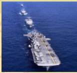
Marine Corps Aviation