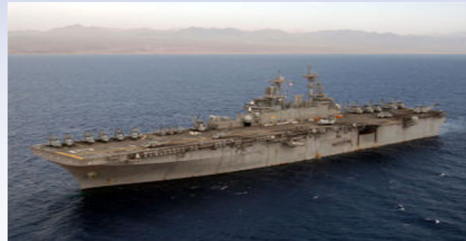
USS Kearsarge Central and South America – Atlantic: August-November