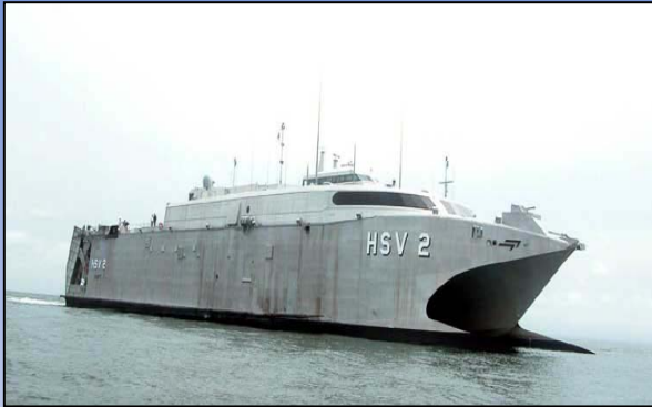
HMS SWIFT West Africa: March-May