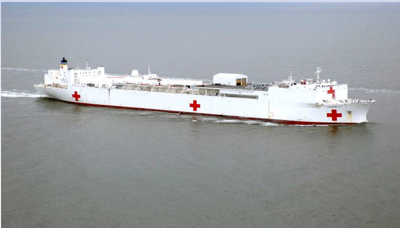
USNS Mercy Southeast Asia: June-September