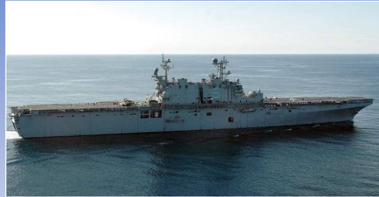
USS Boxer Central and South America – Pacific: May-June