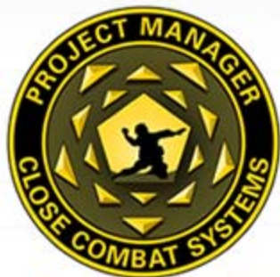
COL Raymond Nulk