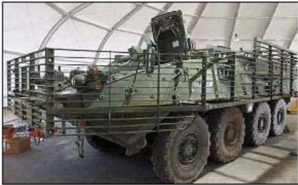
Bar Armor - Counter RPG