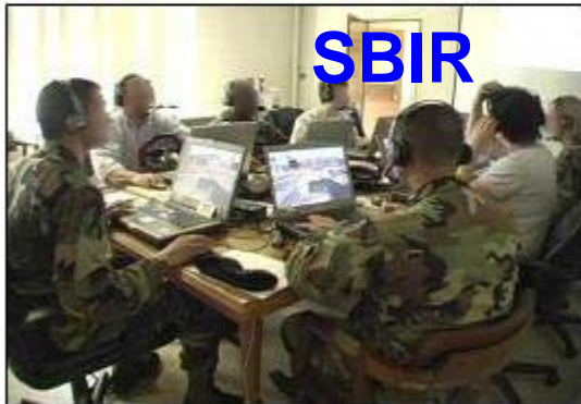
Ambush Language/Culture Training