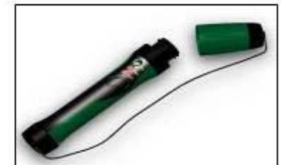
Water Disinfection Pen