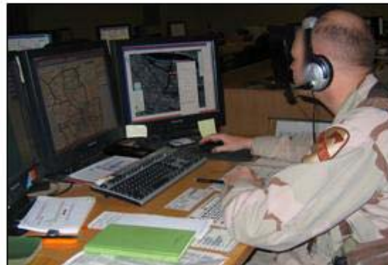
Command Post of the Future